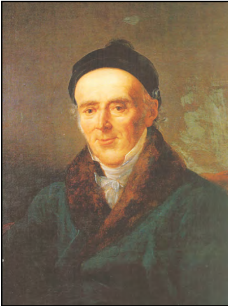
Samuel Hahnemann by Mélanie d'Hervilly

Last month we learned how people discovered the healing potential of naturally occurring substances by a combination of 'trial and error'. By observing and recording the effect these substances had upon individuals, (including poisonings!), we were able to establish a database of knowledge that is still relevant today. In homeopathy, we go one step further. We learn about the finer details of our remedies by running what is called a 'proving'. A proving is where a group of healthy volunteers take a homeopathically prepared substance over a period of time. Not everyone will react but if a prover is sensitive to the substance, they will eventually exhibit symptoms. All the symptoms experienced, physical, emotional and mental, are gathered and recorded in detail. The 'provers' are not told anything about the substance they are taking, so they cannot be influenced by any pre knowledge. Also, the person supervising the proving does not know what substance is being tested. Finally, all the symptoms experienced by the 'reactive' provers are collated and organised systematically. This information forms the basis of our 'Materia Medica', a vast and rapidly expanding database which describes the curative properties of our remedies. Once a newly proved remedy starts to be used in clinical practice we can fine tune some of the prescribing details as we learn more about the substance's healing potential.