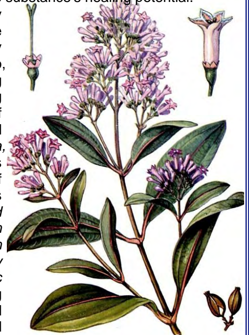
Cinchona officinalis is taken from the bark of the Quinaquina tree. As the name suggests this tree is also the only natural source of quinine which is used by conventional medicine in the treatment of malaria.