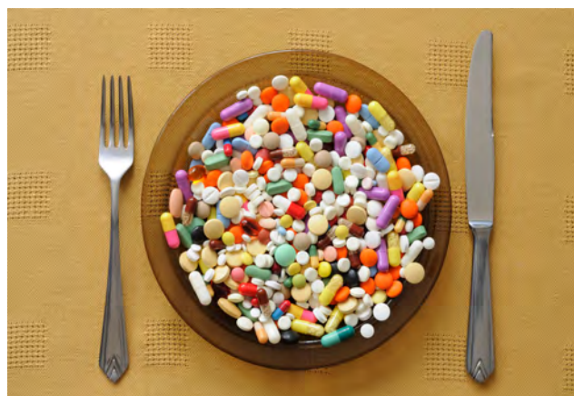
An increased appetite for pills